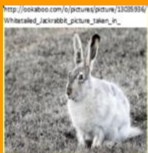
The ears of the jackrabbit keep him cool.