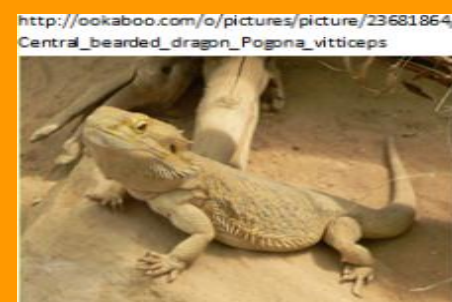
Desert lizards hide under rocks to avoid the heat.

The Mojave Desert was named after the Native American tribe "Mojave". The Mojave Desert is located in Nevada, next to Las Vegas. The area of the Mojave Desert is 47,877 square miles. The Mojave Desert only gets 13 inches of rain per year.