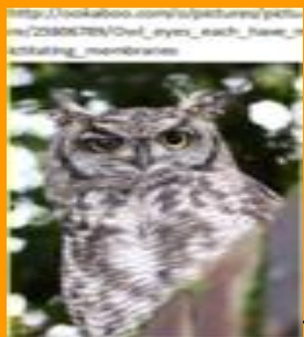
The owl sleeps during the day to avoid the heat.

Creosote bush is a dominant member of most plant communities in the Mojave.