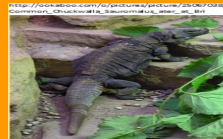
The chuckwalla rarely drinks water from rivers because he gets his water from plants.